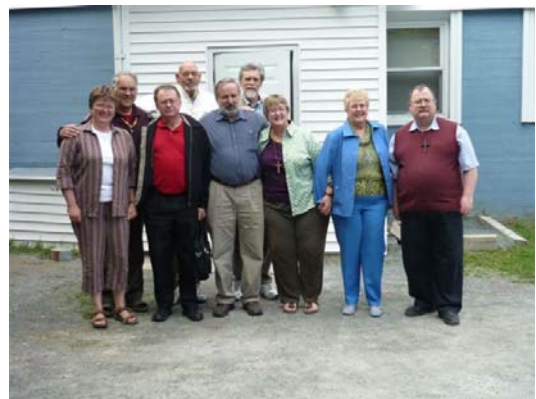
2006 – 2009 Secretariat

A heartfelt thank you to all Cursillistas in the Diocese of Nova Scotia/PEI for their warm welcome to us, and for helping to make these meetings run so successfully. Your hard work and generosity is greatly appreciated.